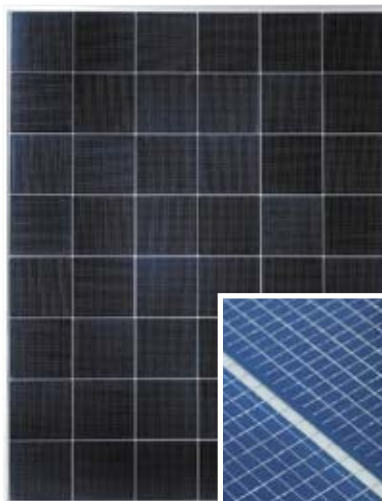
Special: The module is assembled using cells, which have a copper electrode placed perpendicular to the thin silver contact fingers. The bus-bars are next to the cells.

The Day4 Energy electrode is also said to have advantages when processing thin and particularly large cells. That's reason enough for the German cell manufacturer Q-Cells to have committed to the delivery of 104 MW of cells in the next five years.