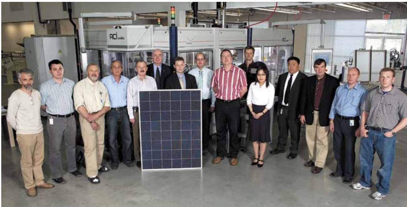
Ambitious goals: Day4 Energy staff with its high-efficiency 190 W module at the new 7 MW production facility in Burnaby, British Columbia. After expansion to 40 MW in 2007, the company plans to double capacity every year.